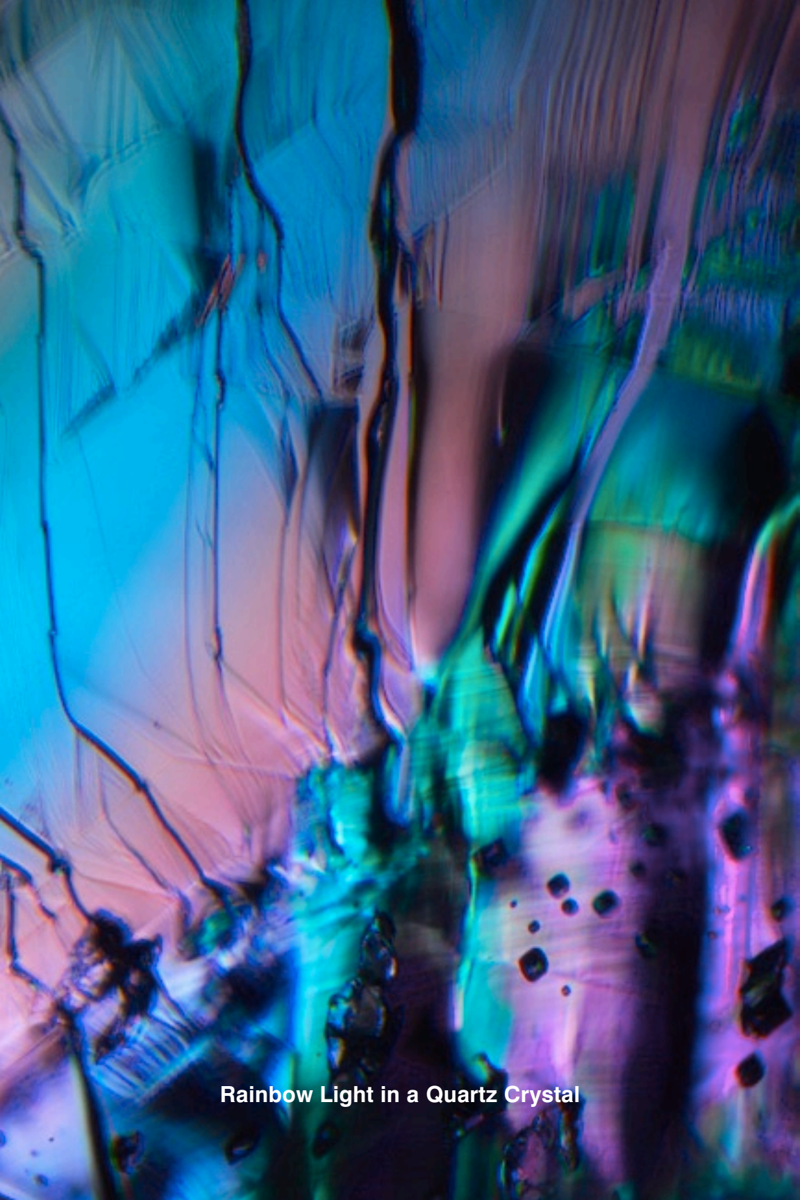
Rainbow Light in a Quartz Crystal